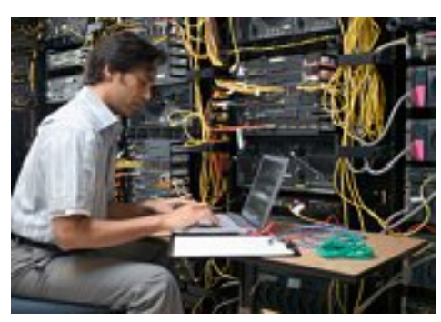
Drivers/Firmware Control Software Image Management Asset Management: Lic, S/N, MAC Tracking Remote Access to Appliances Management