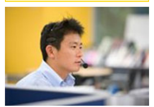
Standard Warranty Repairs Extended Warranty Repairs Advance Replacement Service Product Refurbishment /Upgrade Services Return Depot Management Services Case Management and RMA Tracking Help Desk Support