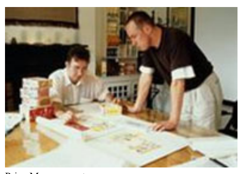
Price Management Part List Research & Approvals Failure Analysis and Reporting BOM Revision, ECO, ECN Management Documentation Control Compliance Re-Certification Component Roadmap Tracking End-Of-Life Planning